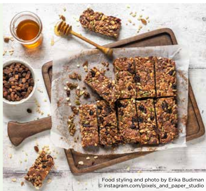
Food styling and photo by Erika Budiman © instagram.com/pixels_and_paper_studio