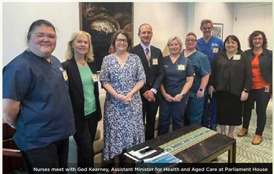
Nurses meet with Ged Kearney, Assistant Minister for Health and Aged Care at Parliament House

“There’s so much work to do in aged care. It’s hard to know where to start, but finally we are getting some progress. I’m hopeful that it will be a continuing process and that it won’t just stop when we get a wage rise and nurses 24/7; I’m hopeful that there’ll be a continuous reform approach.”