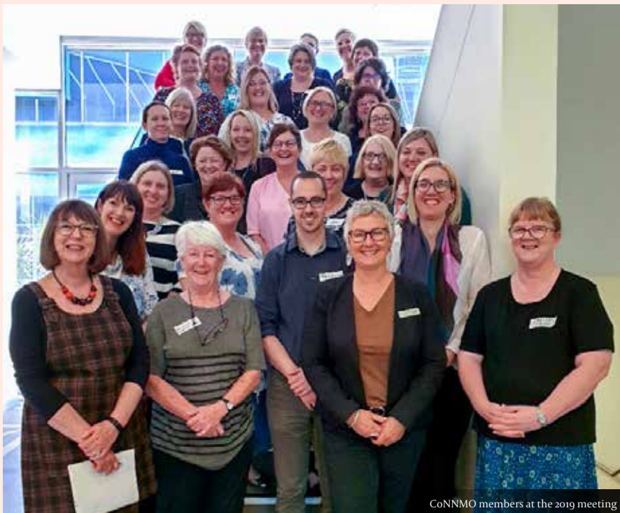
CoNNMO members at the 2019 meeting

Some are set up to be principally networks for dissemination of information; others have a broader remit including professional representation; education; advice and/or