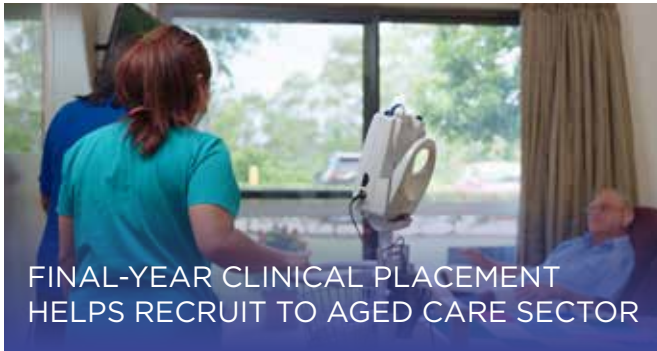
FINAL-YEAR CLINICAL PLACEMENT HELPS RECRUIT TO AGED CARE SECTOR

A novel final-year university placement in aged care is helping nursing students transition work-ready into the sector on graduation.